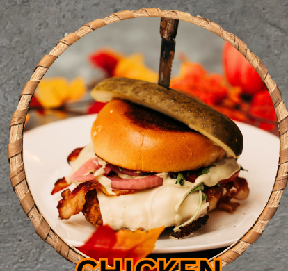
CHICKEN AVOCADO RANCH

Crispy chicken, avocado ranch dressing, provolone cheese, mixed greens, tomato, pickled onions and bacon on a grilled brioche bun