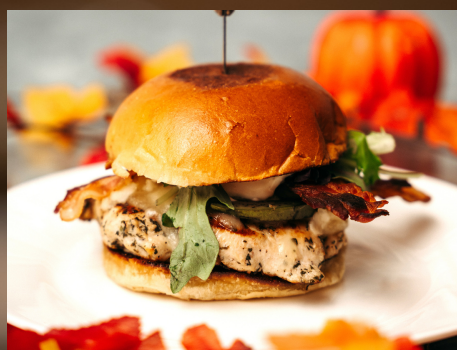
Lemon Pepper Chicken Sandwich