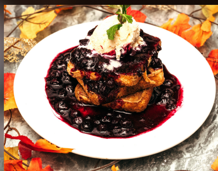
Blueberry Ala Mode