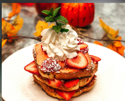
Strawberry Cheesecake Stuffed French Toast