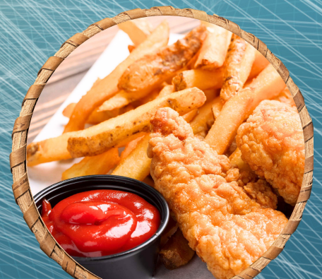
CHICKEN FINGERS AND FRIES

CONSUMPTION OF RAW OR UNDER-COOKED FOODS OF ANIMAL ORIGIN MAY INCREASE YOUR RISK OF FOOD-BORNE ILLNESS. PLEASE INFORM YOUR SERVER IF YOU OR ANYONE IN YOUR PARTY HAS A FOOD ALLERGY