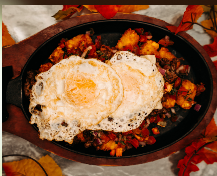
Carne Asada Skillet