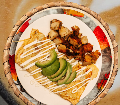
CHICKEN FAJITA OMELETTE

grilled chicken, peppers, onion, cheddar cheese, topped with sour cream and avocado