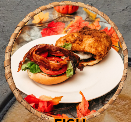
FISH BLT SANDWICH

8 Oz American cheese burger, mayo, lettuce tomato and bacon on three slices of bread