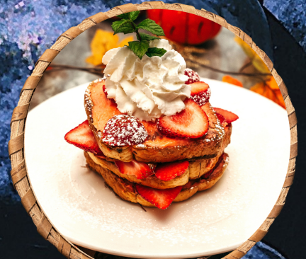
STRAWBERRY-CHEESECAKE STUFFED FRENCH TOAST

Three slices of Texas bread, egg dipped and grilled golden brown, then stuffed with cream cheese and strawberries.