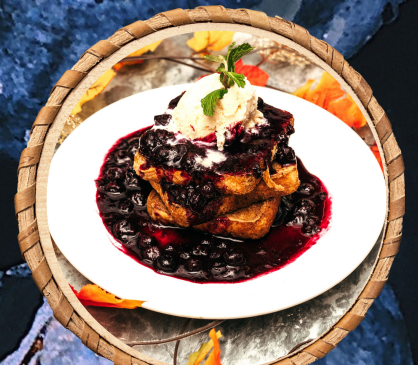
BLUEBERRY ALA MODE

Three Pancakes or French Toast topped with blueberry compote sauce and finished with vanilla ice cream & powder sugar.