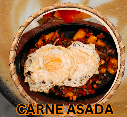
CARNE ASADA SKILLET